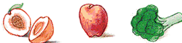
Table 1. Amount of Fibre in Some Foods

If cramps, bloating, and constipation are problems, there are some medications that will help.