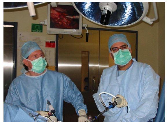
Laparoscopic Anterior Resection