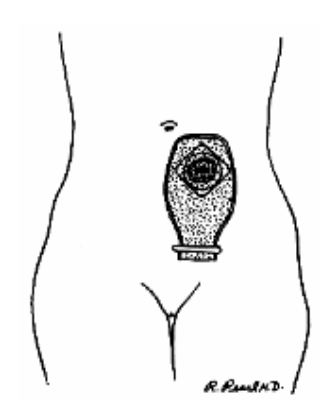
Figure 1: An ostomy appliance is a plastic pouch, held to the body with an adhesive skin barrier, that provides secure and odour-free control of bowel movements.